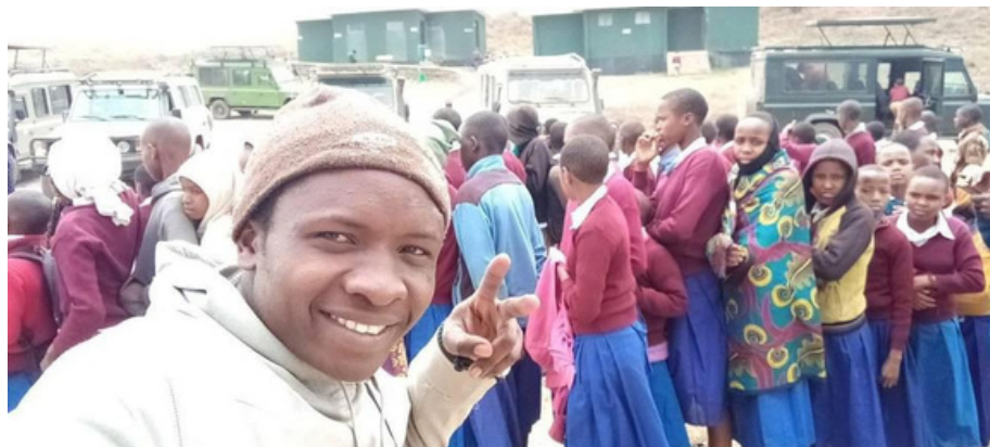
Boarding the Land Rovers to visit Ngorongoro Crater